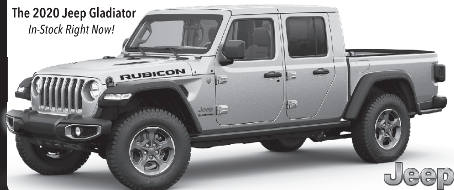
The 2020 Jeep Gladiator In-Stock Right Now!

Chrysler, Jeep, Dodge, SRT and Ram are registered trademarks of Chrysler Corporation, LLC.